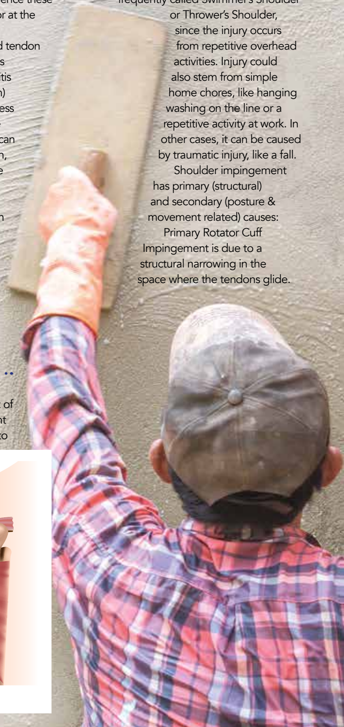
Rotator cuff problems